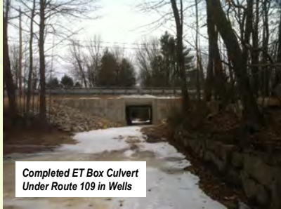
Completed ET Box Culvert Under Route 109 in Wells